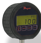
DPG-100 with protective rubber boot