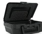
Protective carrying case