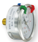
SGY back with accessory pointers