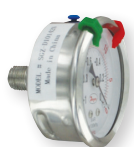
SGZ back with accessory pointers